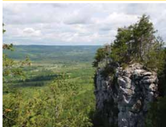
View from the top of Old Baldy Conservation Area overlooking Kimberley and The Beaver Valley.

I was duly impressed [with "Canadians Reliving the Civil War" in the summer issue]. Rare is it for the flavour of Civil War re-enacting to be captured to the degree in which you did it. Kudos. One note, however, with the statement "around 14,000 Canadians died," I fear you've been misled. The actual number is more like 7,000 or 14 per cent of the 50,000 Canadian-born who served which is in keeping with the overall death rate from all causes for all Civil War participants, to wit, 14 per cent. By the way I can name the 50,000 who served, and the 7,000 who died, and it only took 20 years of research to do it.